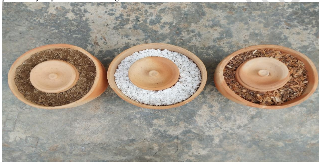
Figure 3. Zeer pot refrigerators with different lining media

The zeer pots were labelled with the use of tape and marker. The bottom of the outer clay pots were filled to a height of 6 cm with the various lining materials of zeer pot. The inner clay pots were placed in outer clay pots and the space between inner and outer clay pots were filled with various lining media (sand (sieved), styrofoam (crushed) and wood shavings) to the top level. The weight of the zeer pots were measured using weighing scale with zeer pots filled with styrofoam, wood shavings and sand weighing 6.96kg, 7.18kg and 15.52kg respectively. Solar dried chili pepper varieties were placed in the various labelled zeer pot refrigerators. Each zeer pot refrigerator was kept 14cm apart (14 cm between rows and 14 cm within rows and each experimental set up was kept in each three (3) communities for three (3) month under room temperature (26 - 34 0 C ). Water (600ml) was used to replenish zeer pots every day on each morning.