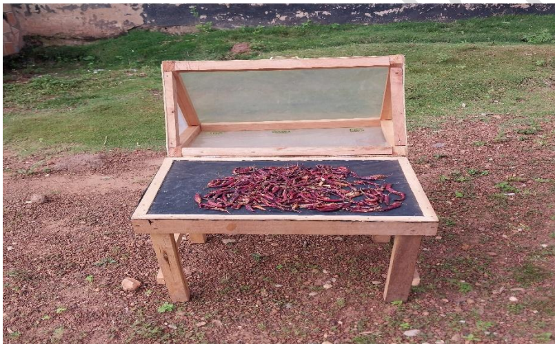
Figure 2. Solar dryer

Blanched chili peppers were dried from 8:00 am to 6:00 pm for two (2) weeks and unblanched chili pepper fruits were dried for three (3) weeks. After drying of chili pepper fruits, the fruit stalks were removed or destalked.