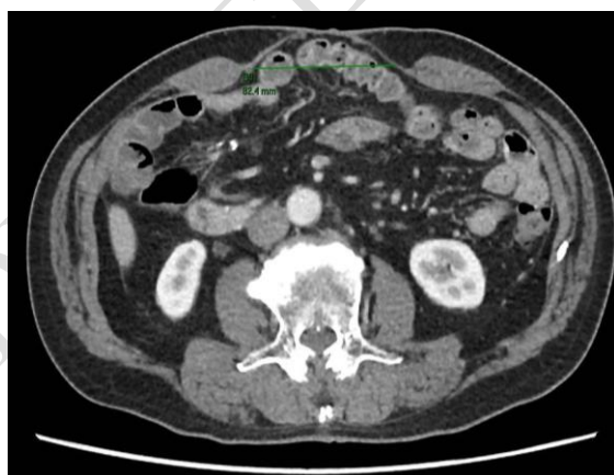
Figure 1: CT showing 8 cm incisional hernia defect

Five months after discharge, he was reviewed in clinic and found to have developed a large 8 x 15 cm incisional hernia above the level of the umbilicus. The large incisional hernia was limiting his daily activities and he was keen for surgical repair.