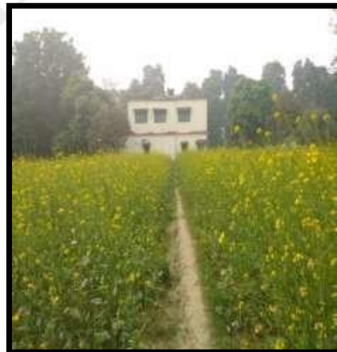
Figure.1: Field view of experimental plots