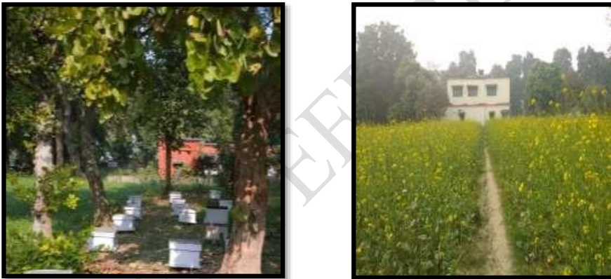
Figure.1: Field view of experimental plots

Honey stores: Firstly, estimation the honey stores with the help of grid frame was done then converting the number of squares covering honey area into grams by multiplying with 8.06 (considering that an average frame full of honey, contained 1000 g of honey) was done. Total honey yielding from all 10 hives was recorded.