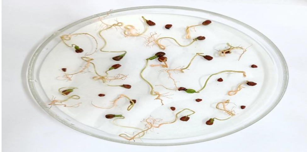
Figure 2. Germinated seeds of Bixa orellana L.