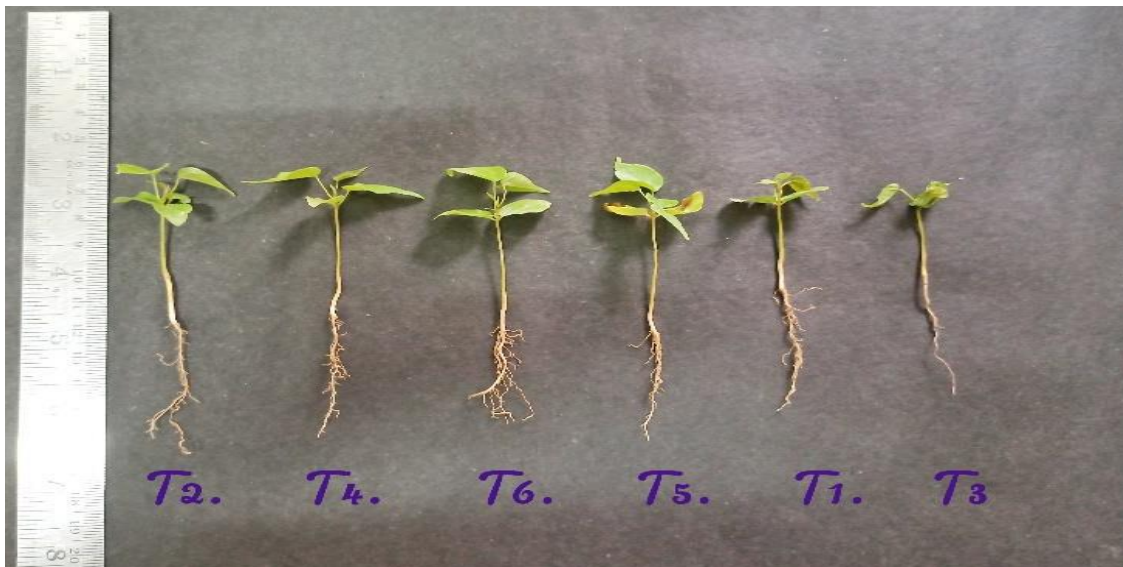
Figure 6. Measurement of seedling growth parameters across different treatments

Data presented in Table 1 reveal a difference between pre-sowing treatments for seedling length of Bixa orellana L. The T5 Treatment exhibited the highest plant length. However, this was followed by the T4, T1, T6, and T2 treatments in descending order. The T3 treatment exhibited the least seedling length.