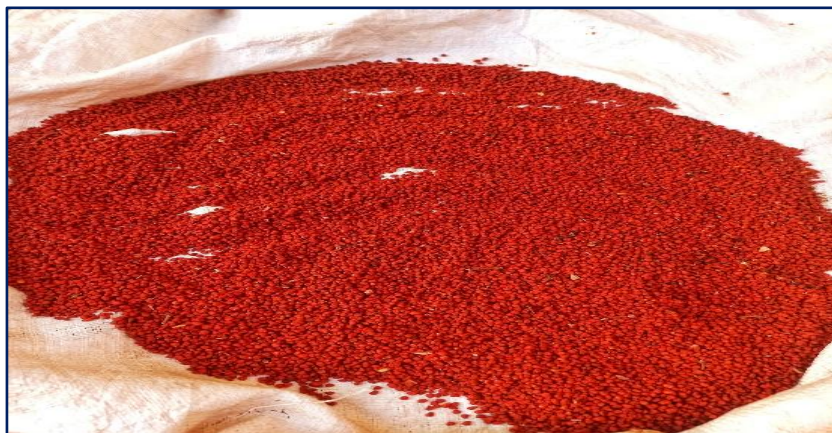
Figure 4. Seeds of Bixa orellana L.

The annatto fruit is a soft echinate capsule (Figure 3) that is ovoid or subglobose in shape. Each capsule contains 30 to 50 seeds (Figure 4) that are tightly packed and covered in a reddish pulp-like substance. The seeds vary in shape from pyramidal to conical. The average length, width and thickness of seeds were 4.53 \pm 0.31 mm, 3.69 \pm 0.27 mm and 2.82 \pm 0.35 mm, respectively, with a seed index (100 seed weight) of 2.83 \pm 0.06 gm and moisture content of 10%. Seed parameters can be considered essential traits for the early selection of seed sources. Sharma et al., 2024 observed considerable differences in seed length, seed width and 100 seed weight of Boswellia serrata collected from three different sources. In addition, a significant positive correlation between seed size and seedling growth was reported in Acacia catechu Willd. and Acacia nilotica Willd. in laboratory and nursery conditions (Khera et al., 2004).