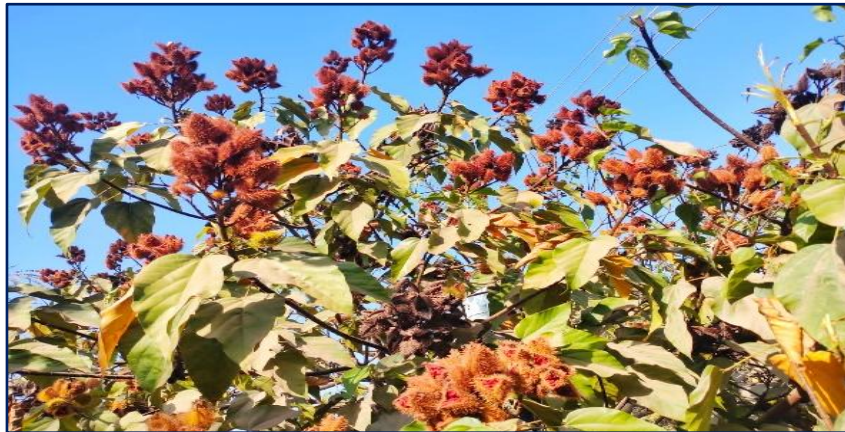
Figure 3. Bixa orellana tree bearing fruits.

The annatto fruit is a soft echinate capsule (Figure 3) that is ovoid or subglobose in shape. Each capsule contains 30 to 50 seeds (Figure 4) that are tightly packed and covered in a reddish pulp-like substance. The seeds vary in shape from pyramidal to conical. The average length, width and thickness of seeds were 4.53 \pm 0.31 mm, 3.69 \pm 0.27 mm and 2.82 \pm 0.35 mm, respectively, with a seed index (100 seed weight) of 2.83 \pm 0.06 gm and moisture content of 10%. Seed parameters can be considered essential traits for the early selection of seed sources. Sharma et al., 2024 observed considerable differences in seed length, seed width and 100 seed weight of Boswellia serrata collected from three different sources. In addition, a significant positive correlation between seed size and seedling growth was reported in Acacia catechu Willd. and Acacia nilotica Willd. in laboratory and nursery conditions (Khera et al., 2004).