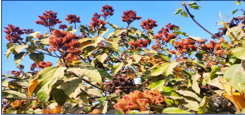
Figure 2. Bixa orellana tree bearing fruits.

The annatto fruit is a soft echinate capsule (Figure 2) that is ovoid or subglobose in shape. Each capsule contains 30 to 50 seeds (Figure 3) that are tightly packed and covered in a reddish pulp-like substance. The seeds vary in shape from pyramidal to conical. The average length, width and thickness were 4.53\pm 0.31\text{mm} , 3.69\pm 0.27\text{mm} and 2.82\pm 0.35\text{mm} respectively, with a seed index (100 seed weight) of 2.83\pm 0.06\text{ gm} . The moisture content of seed was found to be 10%. Seed parameters can be considered as important traits for early selection of seed sources. Sharma et al. (2024) observed considerable difference in seed length, seed width and 100 seed weight of Boswellia serrata collected from three different sources. In addition to this, significant positive correlation between seed size and seedling growth has earlier been reported in Acacia catechu Willd. and Acacia nilotica Willd. in laboratory as well as in nursery conditions (Khera et al. 2004).