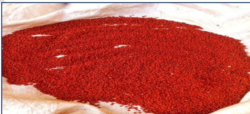
Figure 3. Seeds of Bixa orellana L.

The annatto fruit is a soft echinate capsule (Figure 2) that is ovoid or subglobose in shape. Each capsule contains 30 to 50 seeds (Figure 3) that are tightly packed and covered in a reddish pulp-like substance. The seeds vary in shape from pyramidal to conical. The average length, width and thickness were 4.53\pm 0.31\text{mm} , 3.69\pm 0.27\text{mm} and 2.82\pm 0.35\text{mm} respectively, with a seed index (100 seed weight) of 2.83\pm 0.06\text{ gm} . The moisture content of seed was found to be 10%. Seed parameters can be considered as important traits for early selection of seed sources. Sharma et al. (2024) observed considerable difference in seed length, seed width and 100 seed weight of Boswellia serrata collected from three different sources. In addition to this, significant positive correlation between seed size and seedling growth has earlier been reported in Acacia catechu Willd. and Acacia nilotica Willd. in laboratory as well as in nursery conditions (Khera et al. 2004).