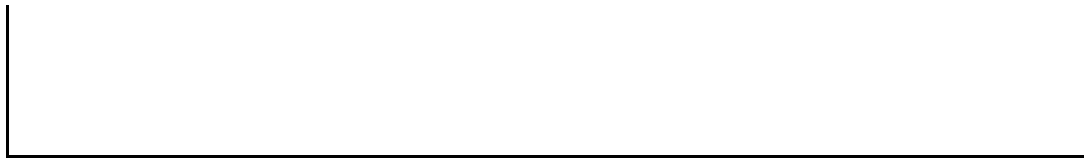
Table 1. Likert Scale for Students' Social Interaction Skills