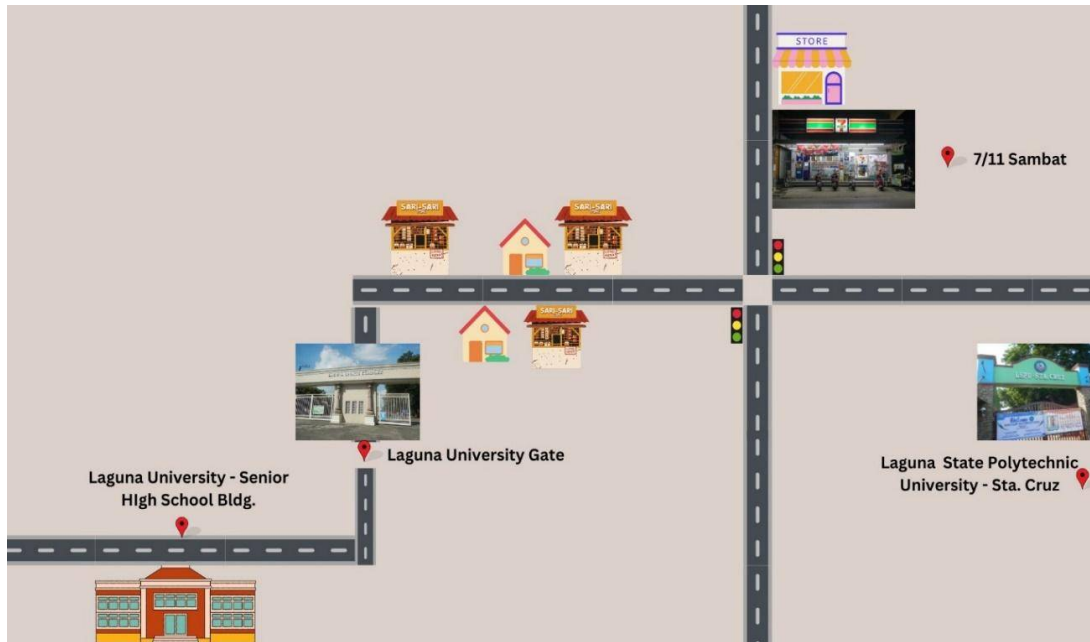
FIGURE 1. LOCATION OF THE STUDY SITE

The simple random sampling technique was used by the researchers for this study. According to Easton and McColl, a simple random sampling method is the basic sampling technique where we select a group of subjects (a sample) for study from a larger group (population). The researchers randomly chose participants from a population and all population members had an equal chance of being selected.