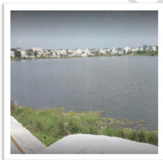
Figure- 1. Rathi Cheruvu

The phytoplankton Identifications were made with the help of relevant standard available literatures and Monographs of Desikachary (1959), Iyengar and Desikachary (1981), Anand (1988), Misra (2008) and Dwivedi (2009). The count of phytoplankton was done by using the Sedwick Rafter plankton counting cell. Main important physico-chemical characteristics of water including water temperature, color, pH were analyzed onsite using mercury thermometer, visual, digital pH meter respectively. While dissolved oxygen and Total dissolved solids were analyzed onsite with water quality monitoring kit at the sampling sites. Rest of the parameters was analyzed according to standard methods (APHA, AWWA, and WEF, 2005).