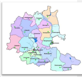
Figure- 3. Map of Bhadrachalam District