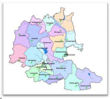
Fig. 3. Map of Bhadrachalam District