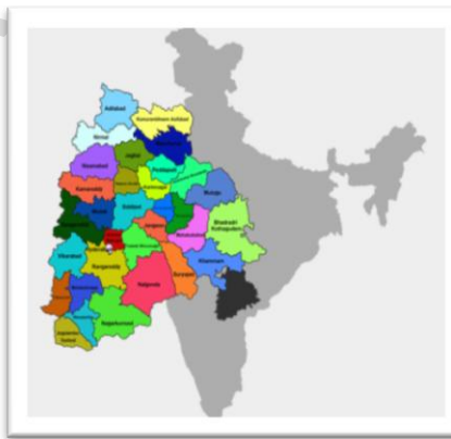
Fig. 2. Map of Telangana State