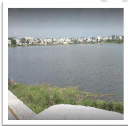
Fig. 1. Rathi Cheruvu

The phytoplankton Identifications were made with the help of relevant standard available literatures and Monographs of Desikachary (1959) , Iyengar and Desikachary (1981) , Anand (1988) , Misra (2008) and Dwivedi (2009) . The count of phytoplankton was done by using the Sedwick Rafter plankton counting cell. Main important physico-chemical characteristics of water including water temperature, color, pH were analyzed onsite using mercury thermometer, visual, digital pH meter respectively. While dissolved oxygen and Total dissolved solids were analyzed onsite with water quality monitoring kit at the sampling sites. Rest of the parameters was analyzed according to standard methods ( APHA, AWWA, and WEF, 2005 ).