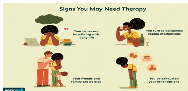
Figure.1 Signs for therapy

Schizophrenia is a condition that exists in all cultures and in all socioeconomic groups( Fortinash et.al.,2004 ). The prevalence of schizophrenia is estimated at about 1 % of the total population ( Videbeck et.al.,2011 ). The prevalence of mental emotional disorders with symptoms of depression and anxiety at the age of 15 reaching 14 million people( Riskesdas et.al.,2013 ). This figure is equivalent to 6% of Indonesia's population. Meanwhile, the prevalence of severe mental disorders such as schizophrenia reaches 400 thousand. 6 to 7 out of 100 households experience schizophrenia or psychosis disorders in Indonesia ( Riskesdas et.al.,2018 ).Schizophrenia has positive symptoms and negative symptoms. Negative symptoms include low self-esteem ( Fortinash et.al.,2004,Twosend 2013, Stuart et.al.,2013 ).