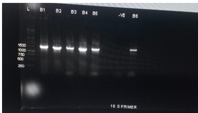
Plate 2: Amplification from all cassava soft rot pathogens isolated from cassava samples obtained from Homabay county in Kenya using 1500bp ladder. Referenced isolates; B1=K03, B2=ND01, B3=R06, B4=ND11, B5=ND06, B6=R01

Percentage similarity of the cassava soft rot pathogen isolates and the isolated published in the NCBI data base ranged 80 – 95% (Table 3).