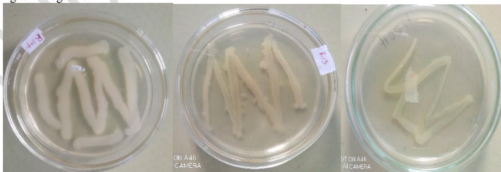
Plate 1. Morphological structures of the isolated bacterial strains: a. Smooth shining white strain. b and c. Cream coloured strains

Morphological characterization was done to identify the physical and growth characteristics of the isolate cultures. All the isolates were able to grow on nutrient agar at 37°C after 24 hours but only thirty-one isolates had positive cultures for cassava bacterial soft rot. In the initial growth, the cassava bacterial colonies would appear whitish before turning cream or yellowish with foul smell. Colonies had either rapid, medium or slow growth with a fine or coarse texture. Majority of the cultures had rapid growth with smooth colony texture. Again, the variation in texture, growth rate and margin appearance was not much evident on Nutrient Agar. In addition, there was no significant variation in color (cream- white) of the colonies except for the ND11 and R06 which appeared cream yellow (Table 1, Plate 1). The individual bacteria had rod- shape peripheral flagellates which were either gram-positive or gram- negative.