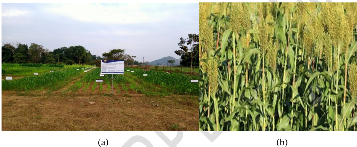
Fig. 1: (a) Overview of experimental plot and (b) Crop at reproductive stage

FYM ha -1 , T 7 : 75% RDF+5t FYM ha -1 , T 8 : 75%RDF+10t FYM ha -1 , T 9 : 100%RDF + 5t FYM ha -1 , T 10 : 100%RDF+10t FYM ha -1 . The recommended doses of fertilizer were applied through urea, SSP, and MOP. Urea application was done at two splits, one as basal and another as top dressing at 30 days after sowing DAS. Sorghum (SSG 59-3) was sown in rabi with the spacing 45 cm x 15 cm and seed rate 8 kg ha -1 . The growth attributes and yield attributes as per the schedule period were recorded. After harvesting the crop yield and economics was calculated. The data were analysed statistically by the analysis of variance (ANOVA) in MS excel 2010 and the significance of different sources of variation were tested by EMS and F-test at 5% probability.