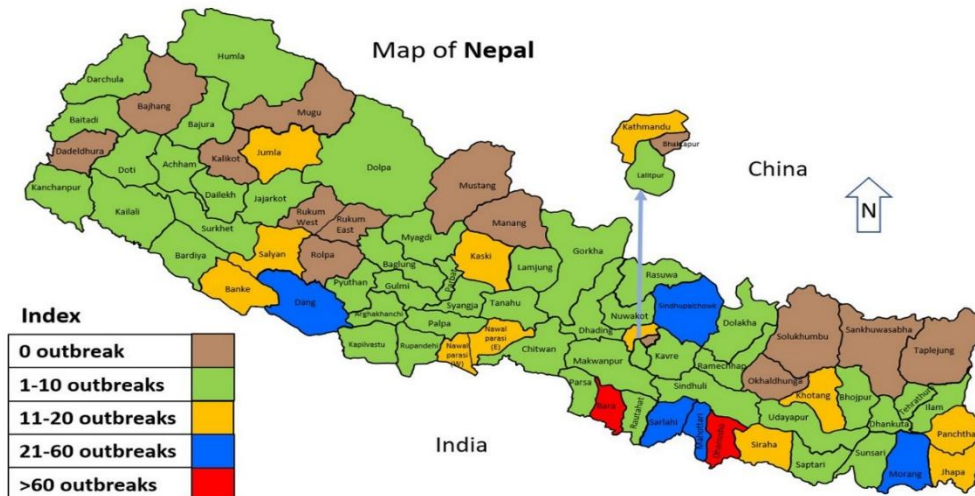
Figure 4: District-wise distribution of PPR in Nepal

Source: (1) and Situation analysis of Peste des Petits Ruminants (PPR) for past 10 (2008–2017) years in Nepal, Veterinary Epidemiology Section, Animal Disease Investigation and Control Division, Tripureshwar, Kathmandu