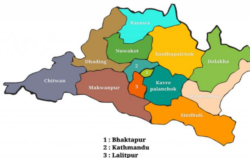
Figure 1: Districts of Bagmati Province

One of the seven provinces of Nepal established by the constitution is Bagmati Province. It is the second-most populous and fifth-largest province in terms of area in Nepal. The province, which has Hetauda as its provincial seat and is also where Kathmandu, the nation's capital, is located, is largely hilly and mountainous and is home to high peaks including Gaurishankar, Langtang, Jugal, and Ganesh. Bagmati Province, which makes up around 13.79% of Nepal's total area and has an area of 20,300 km 2 , contains 13 districts as shown in Figure 1 and has a population of 6044022.