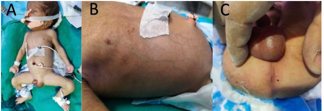
Figure 1. A-C showing soft, mildly distended abdomen with absent anal opening