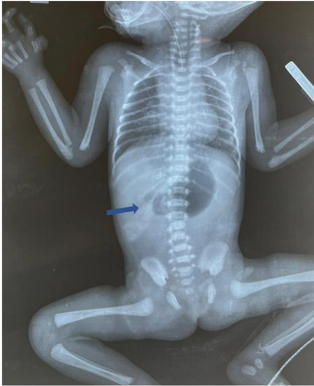
Figure 3. X-ray depicting characteristic appearance of “double-bubble” with no intestinal air beyond the duodenum suggesting duodenal atresia