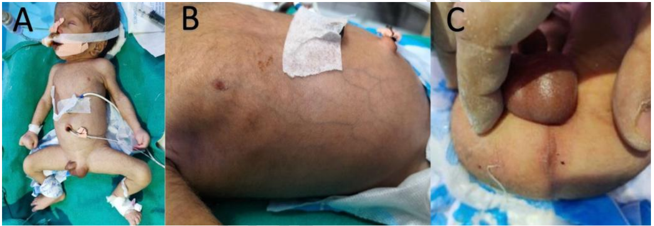
Figure 1. A-C showing soft, mildly distended abdomen with absent anal opening