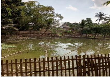
Fig 6. Pond facilities owned by one of the fish farmers in Cikancung Village