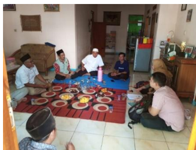
Fig 5. Meeting of Fish Cultivator Organizations in Cikancung Village

The social organizations or fish cultivator groups in Cikancung Village are the Mina Putra Official Group, Subur 2, and the Mina Jaya Group. All of these organizations play a role in improving the welfare of cultivator groups with technical benefits in the form of facilitating production regulation patterns, speeding up the technology transfer process and facilitating the provision of production facilities as well as social benefits which include guaranteeing safety in cultivation, expanding and