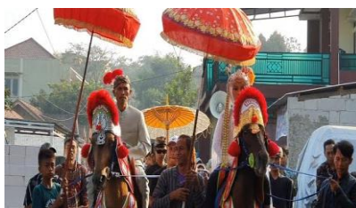
Fig 4. Art of Kuda Renggong

Kuda Renggong is a performance art event or parade. Kuda Renggong is a folk performance originating from Sumedang Regency. This attraction takes the form of a performance by a horse trained to perform dancing movements and walk to the beat of traditional Sundanese music called kendang pencak. A horse is well trained to make movements like dancing or sometimes also make movements like fighting against its trainer in the pencak silat style. Therefore, this show is also often called a martial horse show.