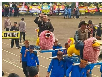
Fig.3 Art of Singa Depok

Singa Depok or what is usually called Sisingaan is one of the arts in Indonesia which was created by artists from Subang as a form of rebellion against the Dutch and British, using a pair of stuffed lions as its main characteristic. Sisingaan is a symbol of the struggle of the people of Subang Regency against the rulers, or invaders, from oppression during the rule of the British Empire. The lion statue symbolizes the ruler/rulers, namely the symbol of the British Empire. The Depok Lion is a way for the Subang people to fight, symbolized by a lion statue and used as a performance that aims to express opinions and satire through this performance.