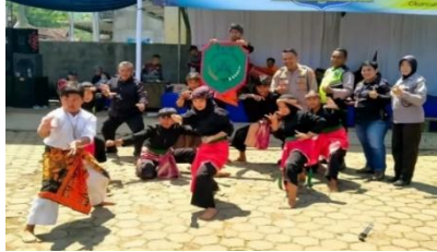
Fig 2. Art of Pencak Silat

Pencak silat art is the result of human culture and also traditional art which aims to defend and maintain independence, as well as to achieve harmony in life in order to increase faith and devotion to God Almighty. Apart from that, pencak silat is also one of Indonesia's cultural heritages that should be preserved because the education imparted through pencak silat can form a tough, strong and virtuous national character and develop into the identity of the Indonesian nation (Zein 2016). Pencak silat developed in line with the historical development of society, the role of pencak silat is quite important in improving the attitude, mentality and quality of the younger generation (Kholis 2016). The implementation of pencak silat learning is not just theoretical, but involves physical, mental, intellectual, emotional and social (Nurkholis and Weda 2015).