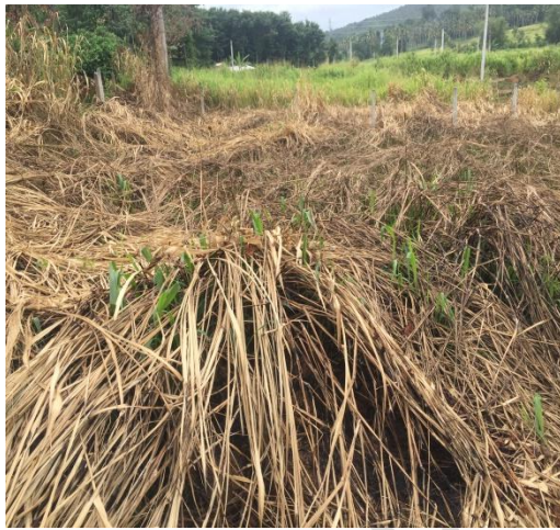
Figure 3; Fire caught land (Source of fire unknown)

requires faster orientation, both physical and psychological. New comers are subject to vulnerabilities, both safety and health such as lack of access to safe drinking water and sewerage, inadequate solid waste management etc. M. Sirajul Islam, (2016) showed that the safe distance from the tube well to the pit latrine varied from site to site depending on the horizontal and vertical distances of the tube well as well as hydrogeological conditions of a particular area. Pit latrines are generally constructed close to tube wells, and this is mainly due to space constraint, hygiene and convenience. Widespread use of pit latrines in rural and suburban areas makes them a major source of groundwater contamination. Effluent from pit latrines contains pathogenic bacteria, viruses, protozoa and helminths. The pathogens from the pit latrine may filtrate through the ground (unsaturated and saturated) and ultimately reach the groundwater. One interview told that ‘We have no option. Do everything within the 12 perches given.’ There are 63 plots of land in an extent of 4 acres of site where in the worst case, the 63 toilets and 63 wells may cause health hazards unless a proper action plan is set out from the beginning.