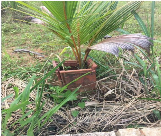
Figure 4: Protection of plants from wild boar and porcupine attack

It is witnessed that there are a couple of wells dug and unused for some time with no safety fence around. Shrubs surrounding these wells and pits restrict visibility in lightly thick jungle. Abandoned wells pose numerous safety concerns every day that don't receive as much attention as a dramatic rescue or fatal accident. Pump houses make some abandoned wells easy to spot. Others are hidden beneath grass and brush. These hidden holes can lead to personal injury or equipment damage (Figure 6). Worse yet, many hand-dug or bored wells are large enough to trap an unsuspecting child, wild animal, or pet. Abandoned wells also threaten groundwater quality. Layers of soil and rock that cap groundwater supplies naturally filter out silt, bacteria, and some