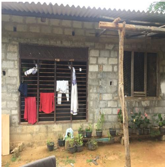
Figure 2: Half erected house with no finishes and protection from weathering effects

through a community well. Inadequate water facilities appear to have resulted from the lack of finance that led to excluding the construction of domestic wells within housing reconstruction. “Our well has water throughout the year, drinkable but edges tend to collapse.” (AP). It seems some measures are required to stabilize soil for long run use. Poor access roads, flooding during the rainy season due to poor land leveling are some of the issues identified. There is a