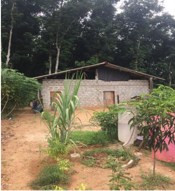
Figure 6: Half erected house with no funds in hand

Furthermore, the beneficiaries demonstrated a lack of awareness regarding habitable finishes. As opposed to settle in habitable finishes, beneficiaries' desire was to fully complete the housing which was not possible with the limited financial grant. Inadequate consideration of low financial gain, a livelihood support package is suggested to enhance the beneficiaries' capacity to generate their own income so that they could complete the remaining construction while occupying the house being rebuilt (Figure 7). Nevertheless, some beneficiaries experienced difficulties in completing the remaining construction due to the low financial income.