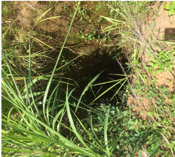
Figure 5: Abandoned well

It is witnessed that there are a couple of wells dug and unused for some time with no safety fence around. Shrubs surrounding these wells and pits restrict visibility in lightly thick jungle. Abandoned wells pose numerous safety concerns every day that don't receive as much attention as a dramatic rescue or fatal accident. Pump houses make some abandoned wells easy to spot. Others are hidden beneath grass and brush. These hidden holes can lead to personal injury or equipment damage (Figure 6). Worse yet, many hand-dug or bored wells are large enough to trap an unsuspecting child, wild animal, or pet. Abandoned wells also threaten groundwater quality. Layers of soil and rock that cap groundwater supplies naturally filter out silt, bacteria, and some