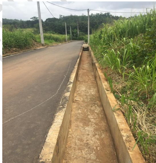
Figure 1: Delayed electricity, tarred road and drainage

None of the resettlement sites had been developed to the levels required when resettlers arrived to establish their dwellings. Although the locations of most of the resettlement sites were acceptable to the displaced households, the provision of basic facilities such as water, electricity, and access roads was lacking for those who first moved to these resettlement sites.