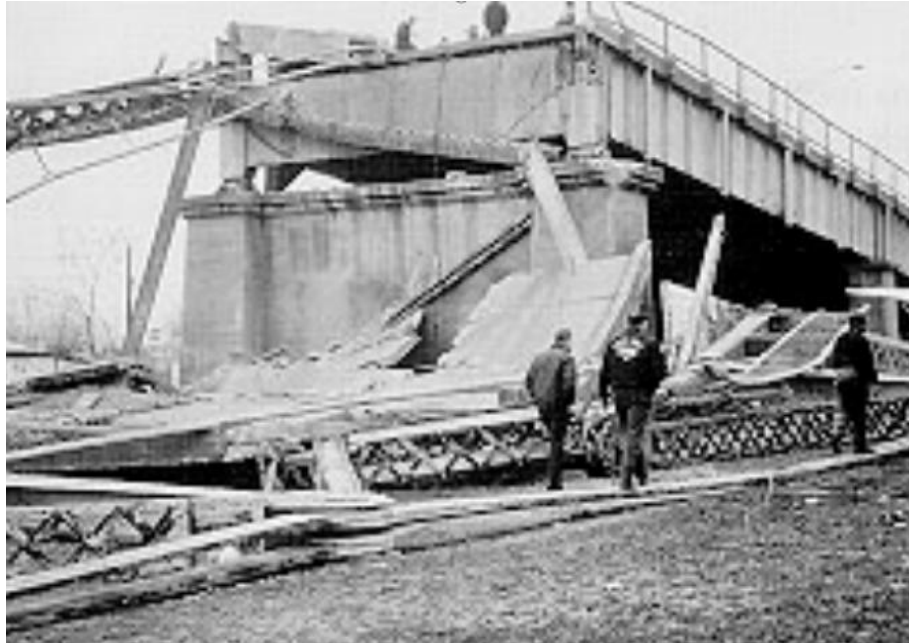
Fig.1 Fatigue destruction accidents

construction of a multi-span simply supported I-shaped steel bridge. Each section of the bridge has a span of 30.5 meters, with a width and height of 9.5 meters and 1.5 meters respectively. In order to support the 24 centimeter thick concrete, four welded I-shaped steel beams need to be welded and combined with force reducing keys to form a composite beam.