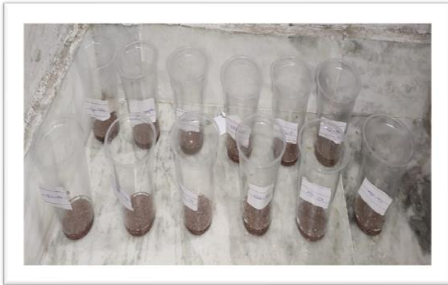
Fig.1 Pre-sowing seed treatment with different concentrations of Calcium chloride and Zinc glycinate

T 12 -Calciumchloride+Zinc glycinate(7% + 7%)-3 hours