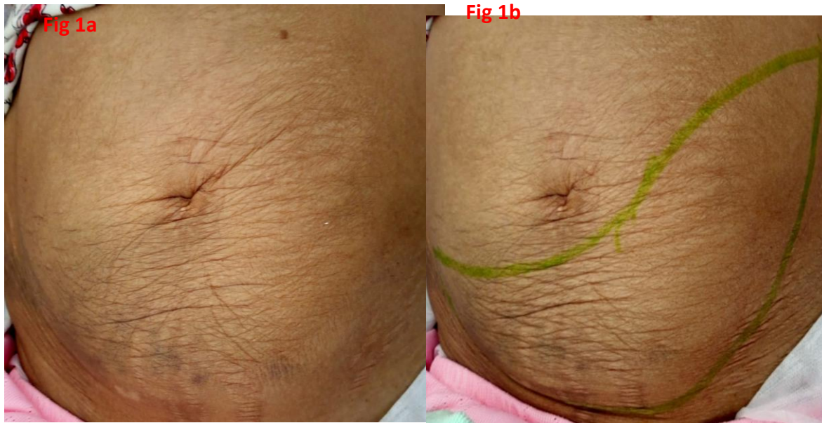
Figure 1: Photography of abdomen:distended abdomen, a -site of an abdominopelvic ecchymosis extending from the left hypochondrium to the right iliac fossa and b -a non-mobilizable, painful mass measuring approximately 12 x 6 cm.

Biological assessment showed a hemolytic anemia at 7.4 g/dl without inflammatory syndrome (C-reactive protein at 12 mg/l and leukocytosis at 8310/mm 3 ). The prothrombin level was 50%. The liver assessment was normal whilst the renal assessment was abnormal (Creatinine at 23 mg/dl, urea at 1.46; GFR at 22ml/min, serum potassium at 5 meq/l) concluding an acute non-obstructive renal failure. The paraclinical assessment was completed by an abdominopelvic computed tomography (CT) scan without injection of contrast product (Fig. 2).