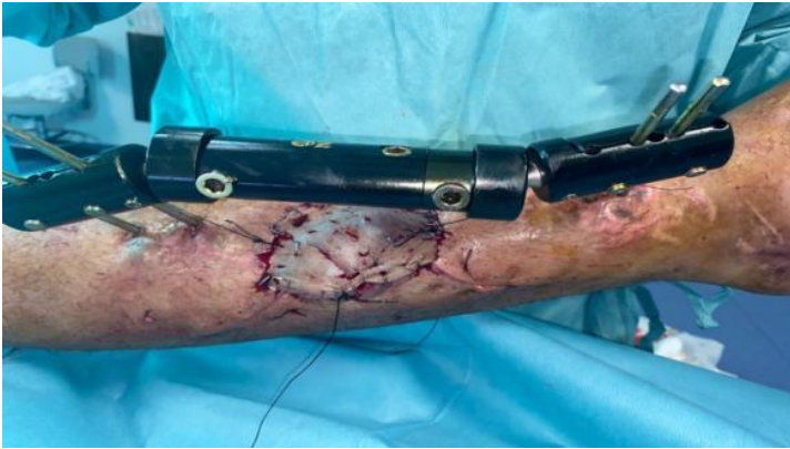
Figure 10: Split thickness skin graft at a later date