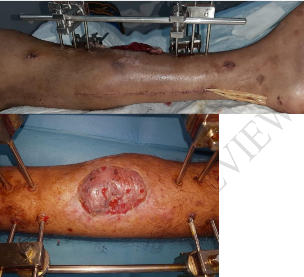
Figure 4: Split thickness skin graft at a later date.