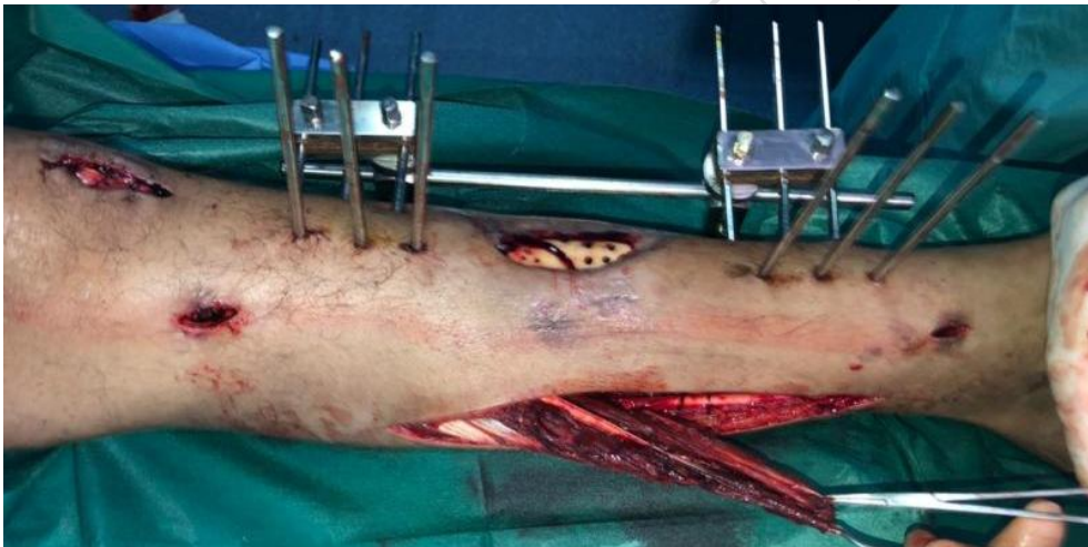
Figure 1: Removal of the intramedullary nailing, thorough debridement of the surgical site, trepanning of the exposed bone, and fracture stabilization with an external fixator.

Comment [PB3]: Change the statement to a better one