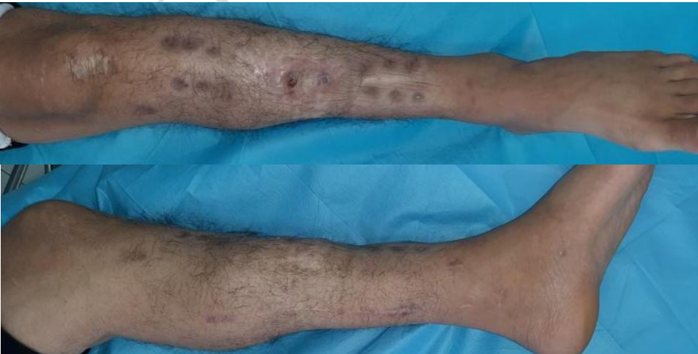
Figure 5: 1-year post-Op