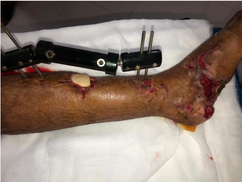
Figure 6: Preoperative picture showing a displaced fracture of the middle third of the tibia with the sequestrum exposed.