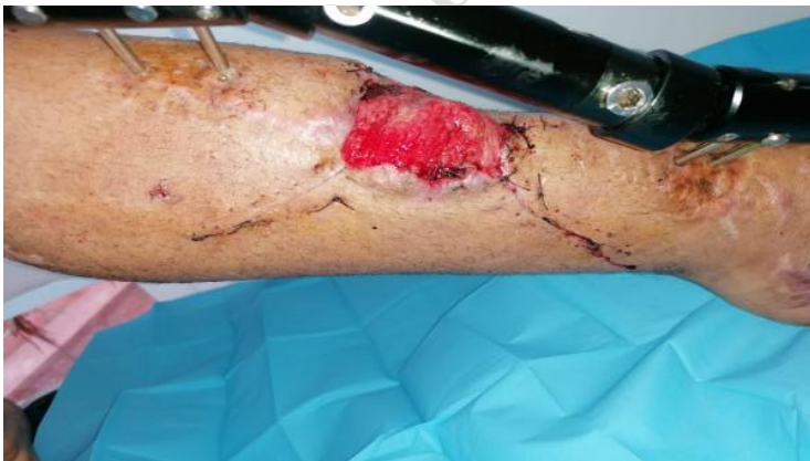
Figure 9: coverage by soleus flap