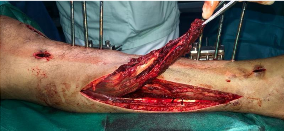
Figure 2: Hemisoleus flap raising.