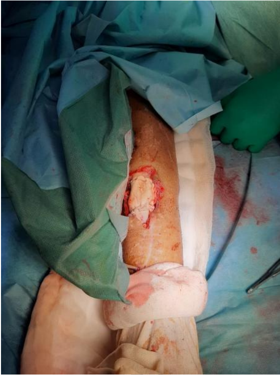
Figure 8: Sequestrectomy and realignment of the two bones with placement of a temporary surgical cement within the wound bed, and fracture stabilization is achieved by replacing the external fixator.