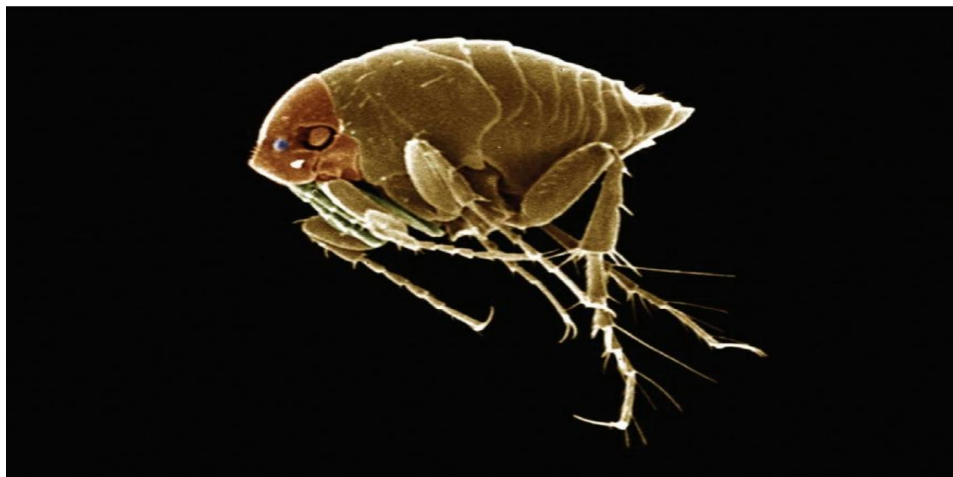
Figure 1. Female Tunga penetrans (Heukelbach et al. , 2008)

The life cycle of T. penetrans involves several stages: egg, larva, pupa, and adult. Following a blood meal, the female flea lays eggs within the environment, typically in sandy soil or floors of houses (Maia & Heukelbach, 2014). The eggs hatch into larvae, which undergo three larval instars before transitioning into the pupal stage. Within the pupa, metamorphosis occurs, leading to the emergence of adult fleas (Heukelbach et al. , 2008). Understanding the different life stages of T. penetrans is crucial for comprehending its biology and transmission dynamics.