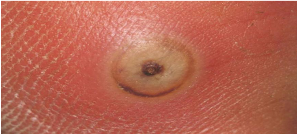
Figure 3: Single lesion caused by a mature flea (Feldmeier &Heukelbach, 2010).