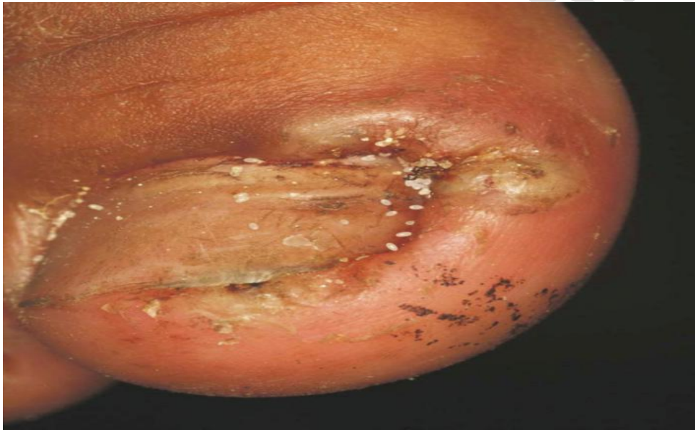
Figure 4: Several vital tungiasis lesions on the first toe (Feldmeier &Heukelbach, 2010).