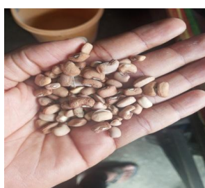
Figure 2: Brown beans