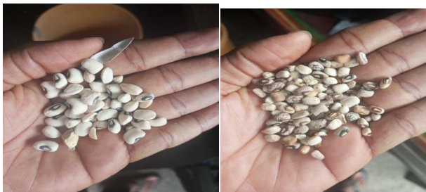
Figure 3: Iron beans