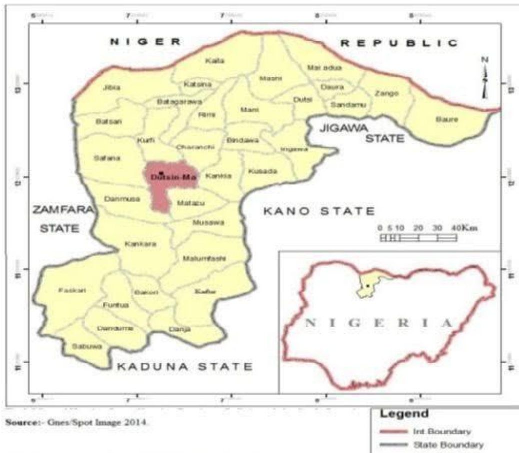
Figure 1: Map of Study Area.