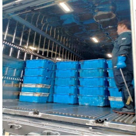
Figure 4. Putting young scallops into the freezer truck for shipping