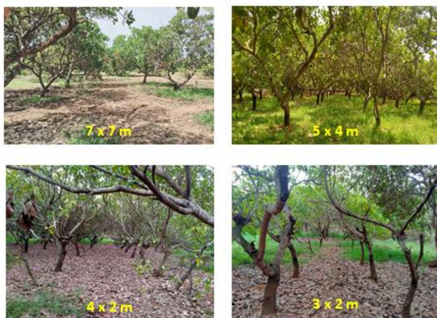
Figure 1. Field view of Cashew plantation under different planting density systems.