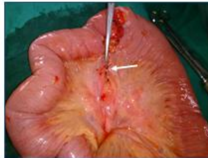
Fig-6 Intraoperative photograph showing transmesenteric defect sutured with 2.0 silk