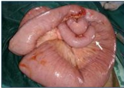
Fig-3 Intraoperative photograph showing strangulation of bowel in transmesenteric hernia