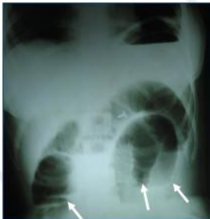
Fig-1 Plain Abdomen x-ray showing multiple fluid levels

An explorative laparotomy was performed, through a mid-line incision. During the procedure, serous fluid was aspirated, and a mass of small bowel was identified in the right iliac fossa. By untwisting the bowel, a herniated segment of small bowel was gently extracted through a large defect located within the terminal mesentery. To our utter surprise, the large oval shaped defect of measured approximately 10x5 cm in size, situated about 20 cm proximal to the ileocecal junction. Vascular arcade was seen all around the defect very near to free edge. After the successful reduction of the internal hernia, the small bowel appeared normal in colour, and there were no signs of bowel gangrene. Consequently, the mesenteric defect was meticulously repaired using interrupted 2.0 silk sutures. No other anomalies or malformations of the small bowel were identified within the abdominal cavity. The abdomen was closed in layers, with the placement of a drainage tube in the pelvic cavity. The postoperative period was uneventful, and the drain was removed on the fourth day following surgery. The patient was discharged eight days after the surgical intervention. (Fig 1-6)