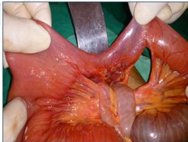
Fig-2 Intraoperative photograph showing a transmesenteric hernia