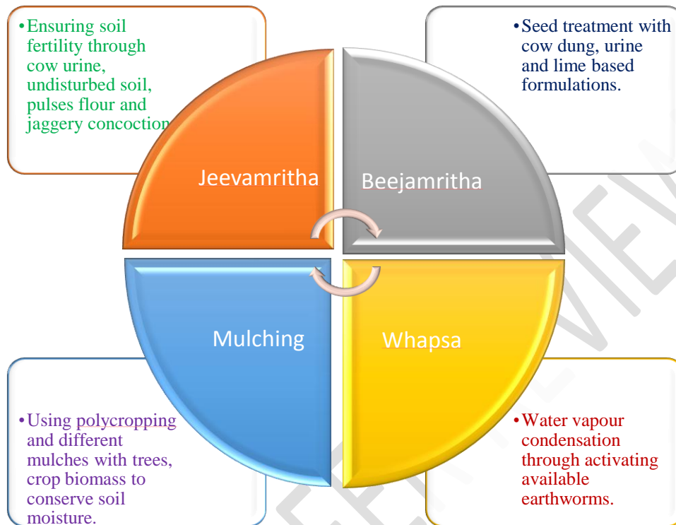
Fig 1: Four essential components of zero budget natural farming.

According to Sh. Subhash Palekar, the ZBNF/NF has following 4 essential components: