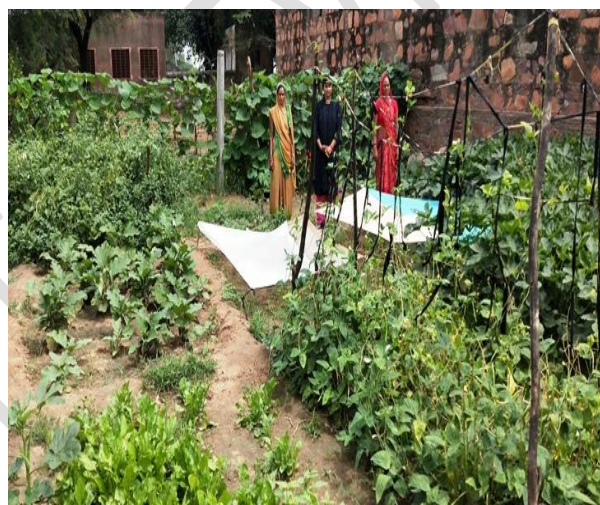
Fig 3. Demonstrated Nutrition Garden at field