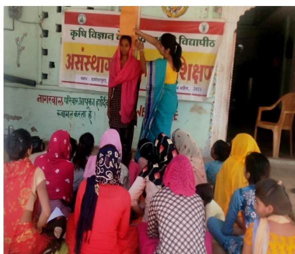
Pic 1. Assessing nutritional status