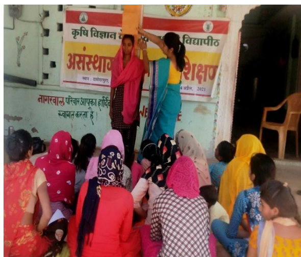
Pic 1. Assessing nutritional status