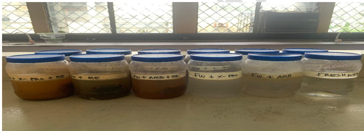
Plate 1: effluent preparation of toxicants (metals with corrosion inhibitors soaked in fresh and brackish water for 30 days before toxicity setup)

to a pipeline metal then allow to dried for one week. The metal with the respective corrosion inhibitor was stock in 1500ml of the water samples: freshwater, and brackish respectively allowed for another one month which served as effluent toxicant with metal for the toxicity testing (Nrior and Gbotu 2017). Also 20ml of the respective corrosion inhibitor was measured and transferred to 1500ml of the water samples and allowed from one month for effluent without metals.