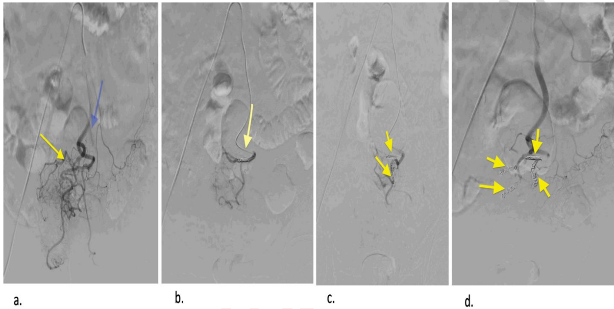
Fig 2 – Pictures showing trans arterial embolization a. pre-procedure angiogram showing multiple feeder branches arising from the Inferior mesenteric artery, b and c . embolization with coil showing decreased filling of AVM and d. Post-procedure angiogram showing complete absence of filling of the AVM.