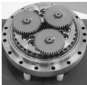
Fig. 1 .RV Reducer