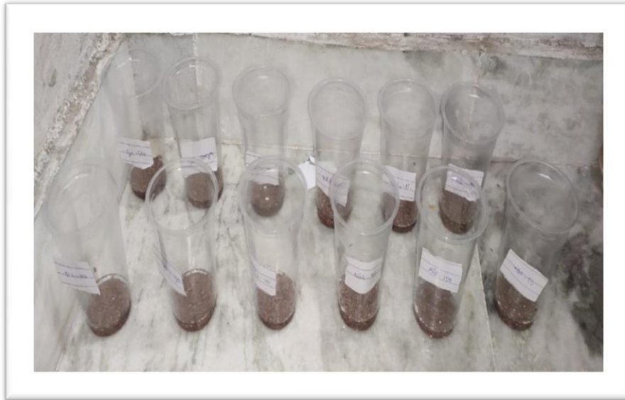
Fig.1 Pre-sowing seed treatment with different concentrations of NAA, KCl, KNO 3 and CaCl 2