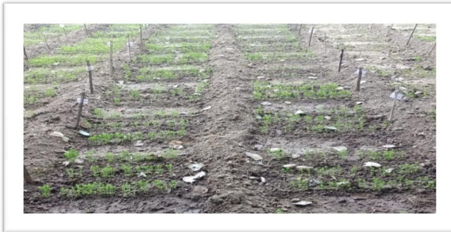
Fig 2. Linseed crop after 20 days of sowing