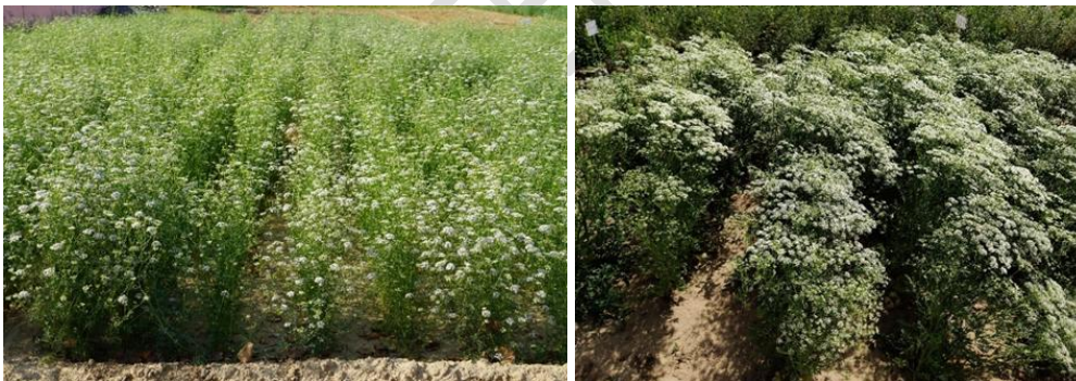
Fig. 2. Line sowing in Ajwain

Comment [U1]: Enlarge the figure to make it sharper