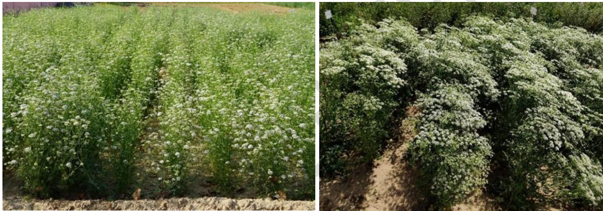
Fig. 2. Line sowing in Ajwain