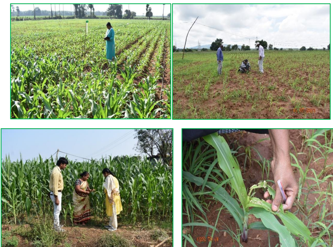
Fig.2. OFT on management against Fall Army Worm