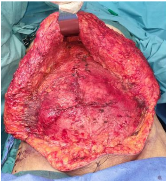
Figure 6 : Dissection extending up to the costal margins and the xiphoid process.

The patient's position is then adjusted to a semi-sitting one, facilitating the alignment of the upper and lower edges of the abdominal wall, a crucial step in achieving the desired outcome. Excess skin is carefully resected, and the skin is meticulously closed over double Redon drains, promoting efficient fluid drainage during the early postoperative period (Figure 7).