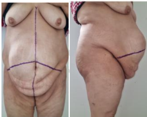
Figure 1 : The drawing of a standard abdominoplasty.

Drawing of a standard abdominoplasty with or without umbilical transposition patient standing before before entering the operating room (Figure 1).