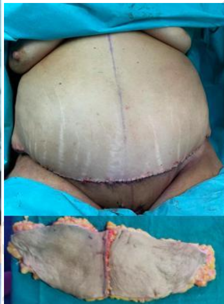
Figure 7 :The skin is closed and excess skin resected a neo-umbilicoplasty will be performed later in this case.

The dressing is a comprehensive one, incorporating elastic compression that covers the entire dissection area up to the epigastric region, supporting postoperative recovery (Figure 8).