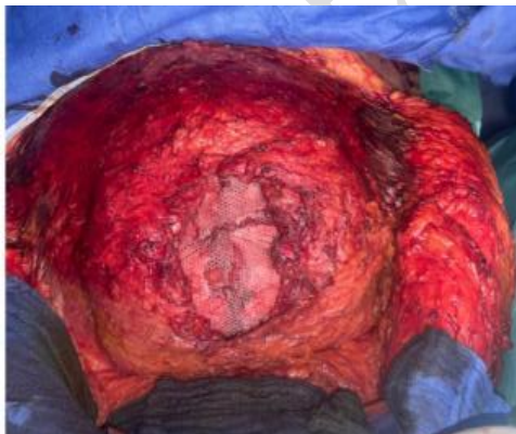
Figure 4 : Polypropylene-coated mesh is placed over the posterior rectus fascia.

The retrorectus spaces are entered bilaterally and extended both superiorly and inferiorly, from the symphysis pubis to the xiphoid. The posterior sheath is closed in the midline with an absorbable running 0 monofilament suture. A lightweight macroporous polypropylene-coated titanium mesh is placed over the posterior rectus fascia (Figure 4, 5). The abdominal muscles are sutured together. This mesh placement is followed by suturing of the aponeurotic plane.