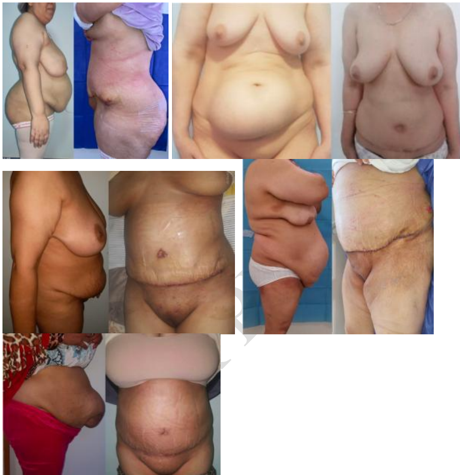
Figure 9: Photo before and after surgery of the 5 cases.

The postoperative outcomes were exceptionally favorable, with no recorded complications among any of the patients (Figure 9). All individuals experienced significant improvements in both functional and cosmetic aspects. In a singular instance, one patient required a planned umbilicoplasty as part of her personalized treatment plan. During the follow-up period spanning 1 to 3 years, there were no reports of complications or hernia recurrences.