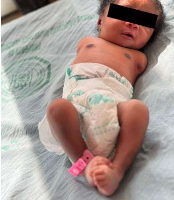
Figure 1: Clinical image of the neonate showing complete absence of both upper limbs and normal lower limbs