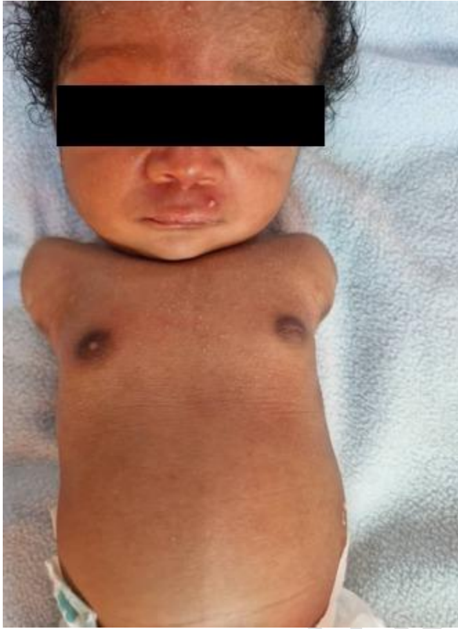
Figure 3: Clinical image of the neonate showing complete absence of both upper limbs