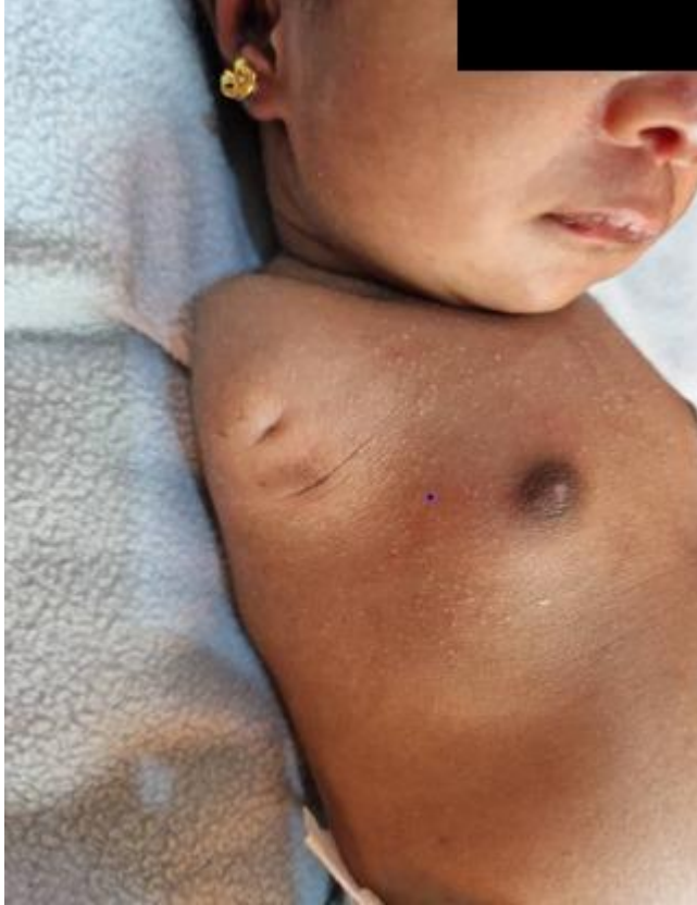
Figure 2: Clinical image showing the complete absence of both upper limbs and a dimple in the right armpit