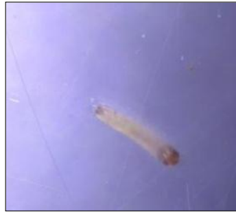
Fig 2. First instar larvae of C. cephalonica