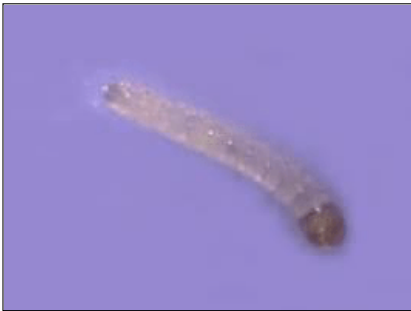
Fig 3. Second instar larvae of C. cephalonica