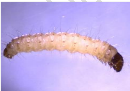
Fig 5. Fourth instar larvae of C. cephalonica