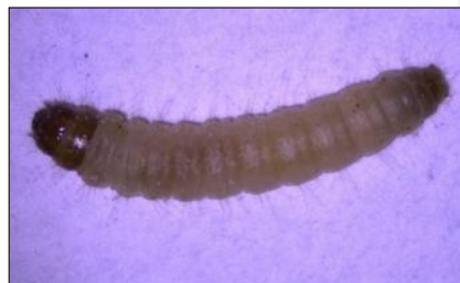
Fig 6. Fifth instar larvae of C. cephalonica