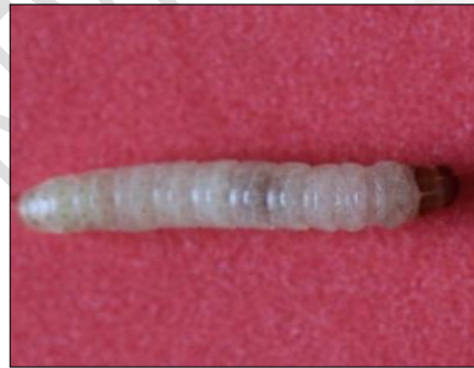
Fig 4. Third instar larvae of C. cephalonica