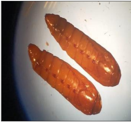
Fig 7. Pupae of C. cephalonica