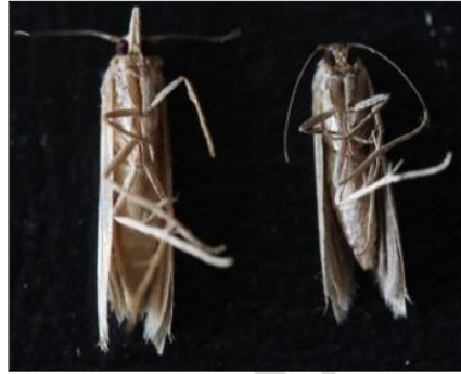
Fig 8. Adult of C. cephalonica