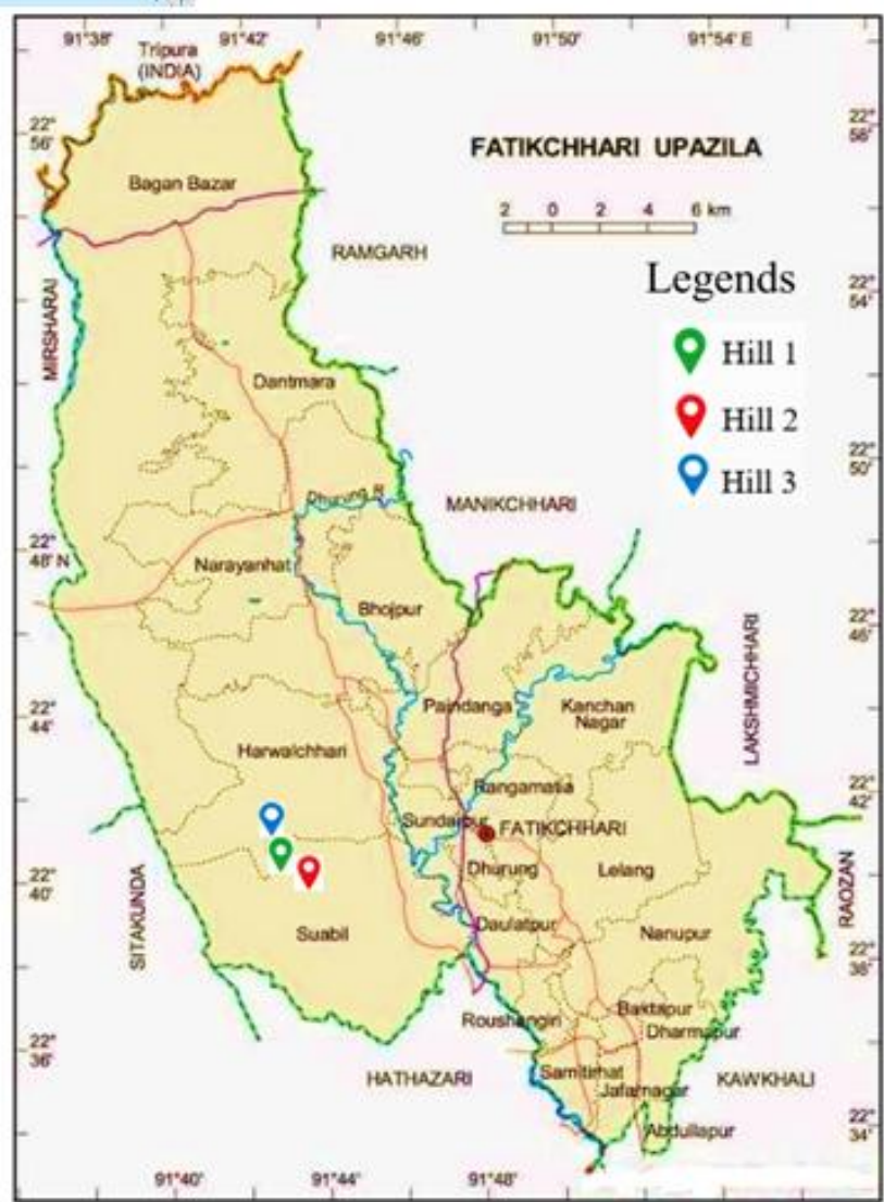
Fig. 1. Location of sampling sites