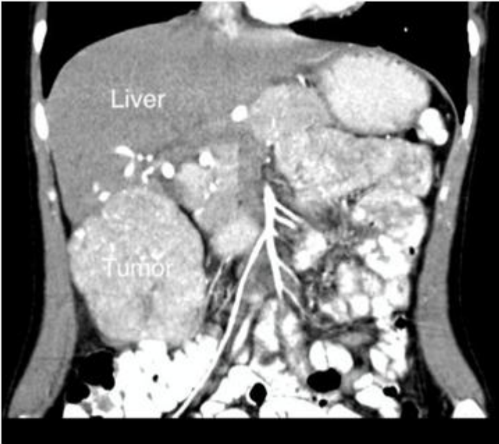
Fig.3: Coronal Section showing the tumor arising from the inferior right lobe of liver