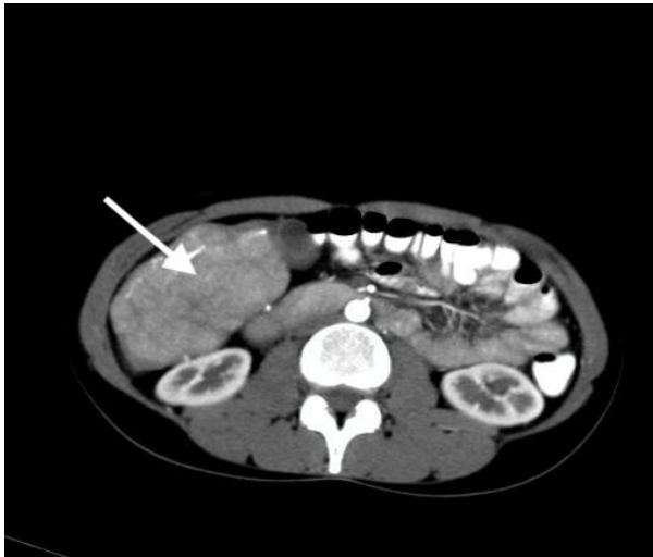
Fig.1: Axial section of CECT showing the lesion (as indicated by arrow)

liver dullness. Liver serology was negative. Ultrasonography (USG) of the abdomen showed a well-defined oval isoechoic solid lesion of 7.5 cm x 5.8 cm in the right lobe of the liver with no calcification or cavitation. Computed Tomography (CT) of the abdomen revealed an exophytic mass of 7.1 cm x 7.3 cm x 9.5 cm arising from the inferior right lobe of the liver with prominent arterial recruitment as shown in figures 1-4.