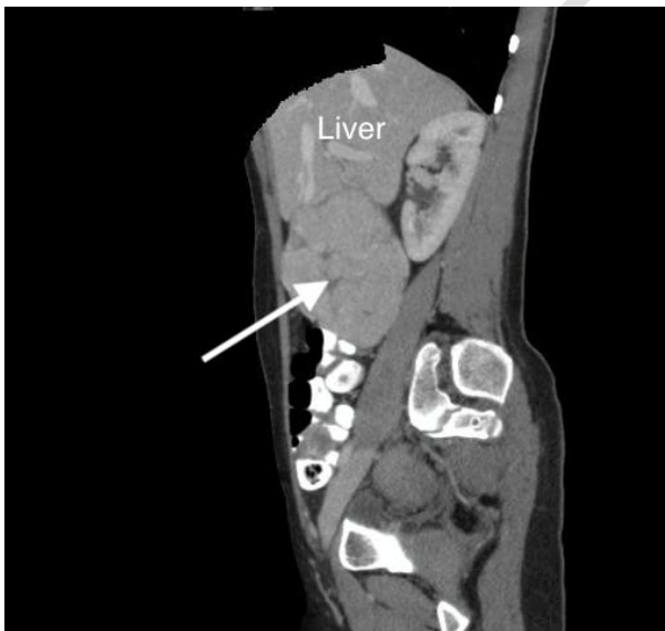
Fig.2: Sagittal section showing tumor (as indicated by arrow) arising from liver.