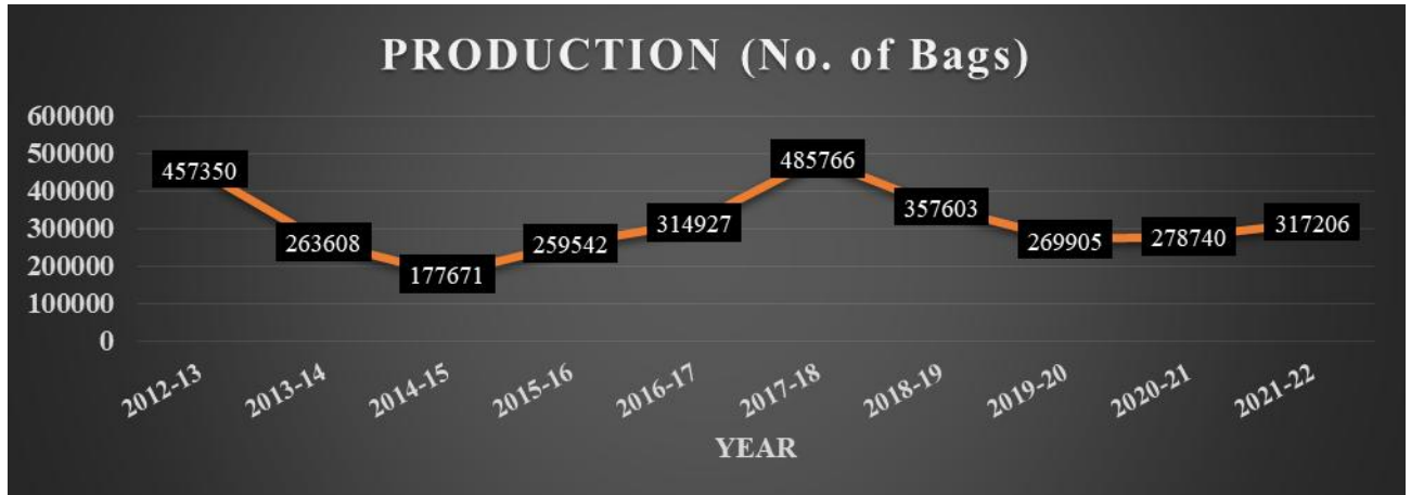
Graph 1: Annual Production (No. of Bags) of Tendu Leaves in Rajasthan (2012-2022)

collection was recorded in the year 2017-18, 485766 bags of tendu leaves were collected. In terms of revenue, the growth rate was 1.089 which was significant at 5 per cent L.O.S. The revenue is completely dependent upon the production. The highest revenue generated was ₹ 8282.41 Lakhs in the year 2017-18. Graph 1 and graph 2 show the annual production of tendu bags and revenue from tendu leaves collection.