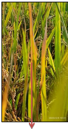
Fig 2: Water soaked lesion with wavy margin