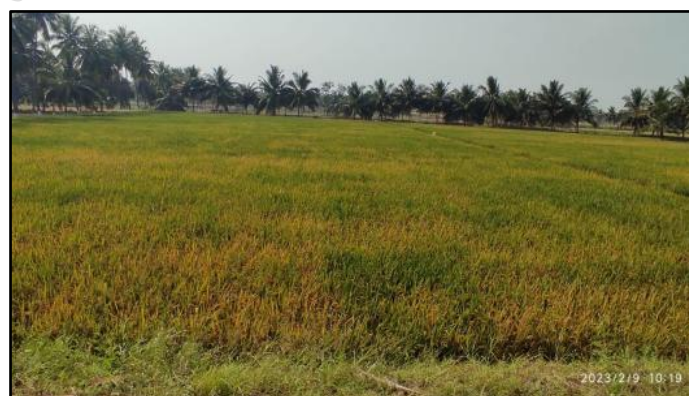
Figure 1. Severity of symptoms in BLB of rice

The characteristic symptom of bacterial leaf blight of rice ie. , water soaked lesions with wavy margin was observed during the survey. On seedlings, the tips and margins of the leaves develop grey-green streaks that subsequently merge together, turn yellowish-white with wavy edges, and cause the leaves to wilt, dry out, and die. Early infection on transplanted rice is found systemic, affecting the entire plant, and resulted symptoms referred to as "kresek". Older plants developed pale yellow steaks with wavy margins that extend from the tips towards the base of the leaf before drying up and dying ( Figure 1 ). Shankara et al. , 2016 collected diseased leaves infected with BLB from eighteen agroclimatic zones of southern region during heading and maturity stage. They reported the development of disease during the plant growth stages.