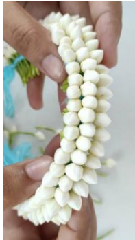
Figure. 3 : Veni arrangement