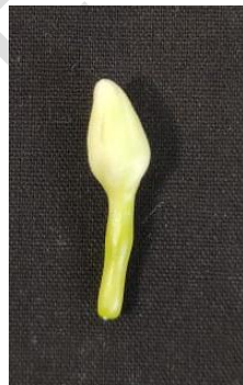
J. auriculatum buds