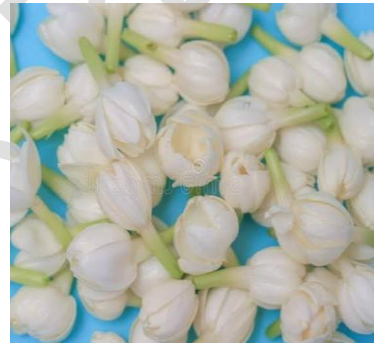
J. sambac buds