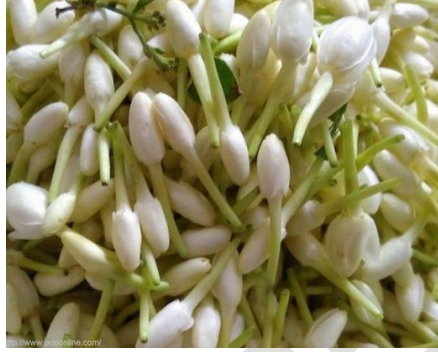
J. auriculatum buds