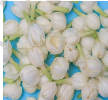
J. sambac buds